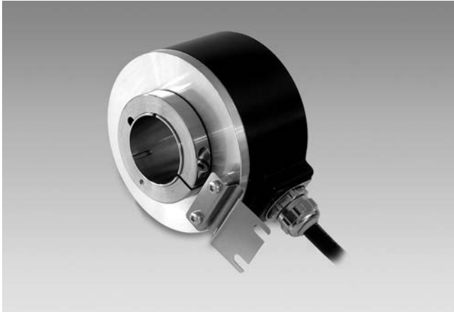
ITD 41 A 4 Y68 with through hollow shaft